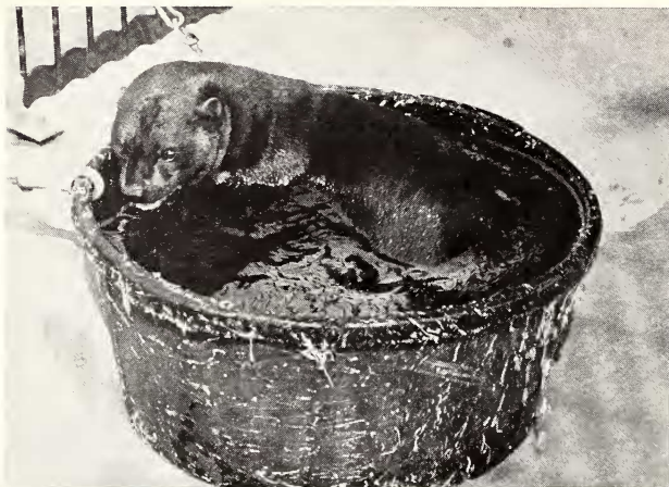
Fig. 1. ♂ in cooling bath

siderably later and re-enter it earlier. On very cold days, the den is only left for voiding and feeding. The dens are kept clean and defecation and micturition seem to occur randomly on the ground, although some preference is given to the top of the boulder; the lactating ♀, however, and later her young do use a common toilet area away from the den (POGLAYEN-NEUWALL and POGLAYEN-NEUWALL in preparation).